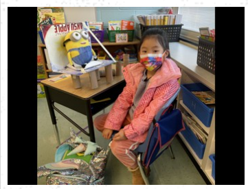
Look at my chair!!!! Maybe I will be a scientist or an engineer!!