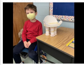
Engineers in the making!!!